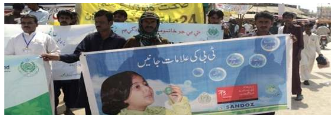
TB WALK AT DISTRICT THARPARKAR ON WORLD TB DAY 2014