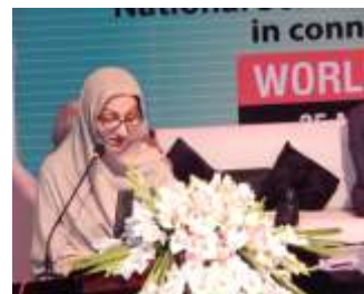
Hon. State Minister for NHSR&C Ms. Saira Afzal Tarar