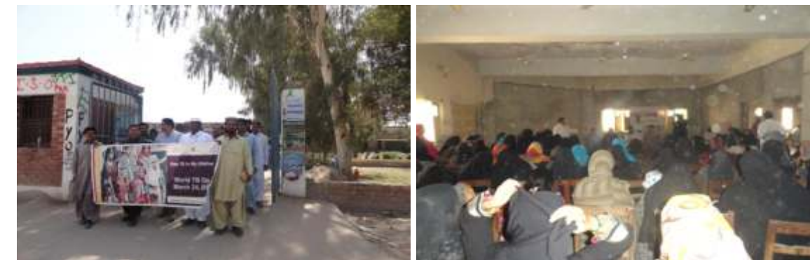
TB Walk and Seminar on World TB Day 2014, at Shikarpur