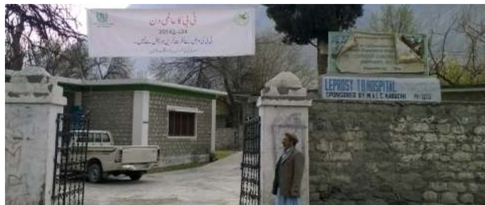
Banner displayed at Amphy TB and Leprosy Hospital

Gilgit city, Secretary Health Office, main Gilgit City Park and hospitals were branded with World TB Day and TB Awareness banners. Also in other districts of GB, main cities were branded with banners and posters.