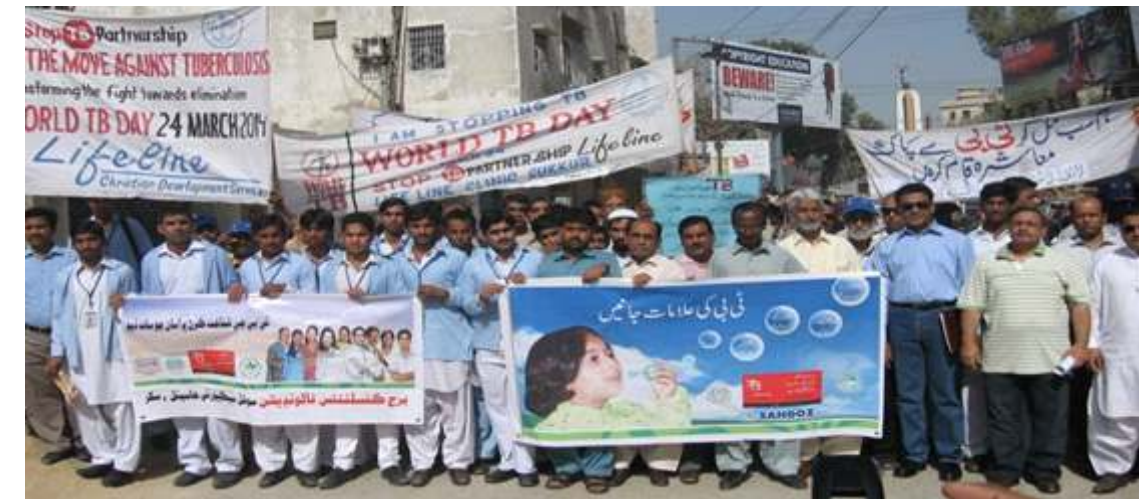
TB Walk on World TB Day 2014 at Sukkur