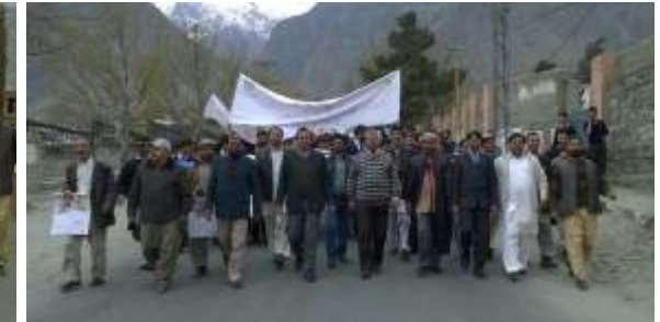
Awareness walk passing through the main Gilgit B