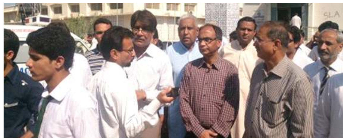
TB WALK ON WORLD TB DAY 2014 AT LARKHANA