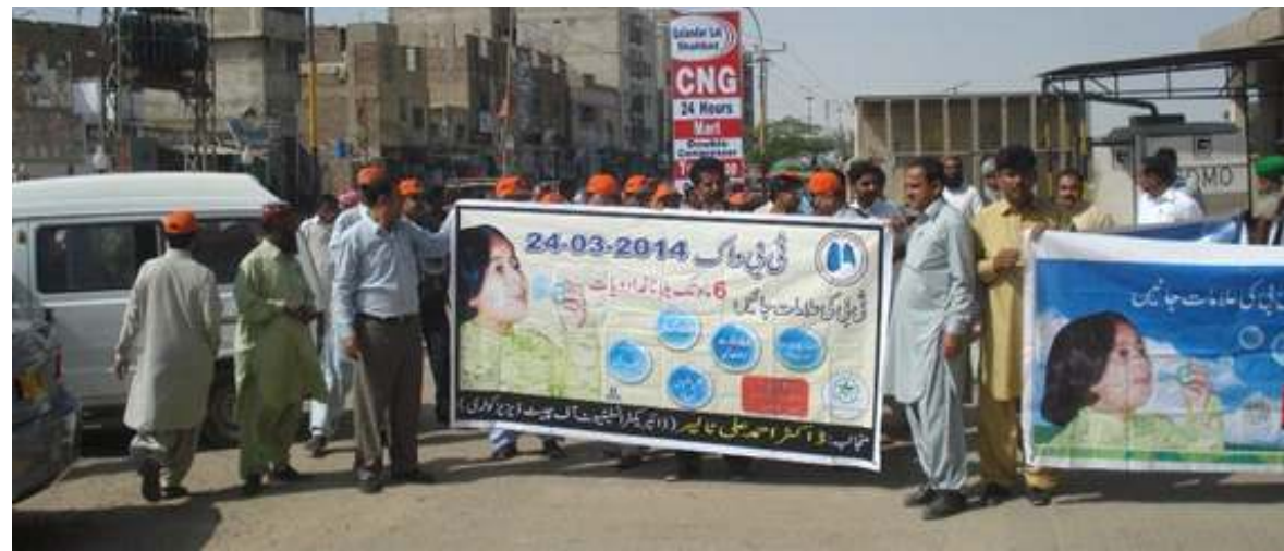
TB WALK WAS ARRANGED ON 24TH MARCH 2014, By ICD Kotri District Jamshoro