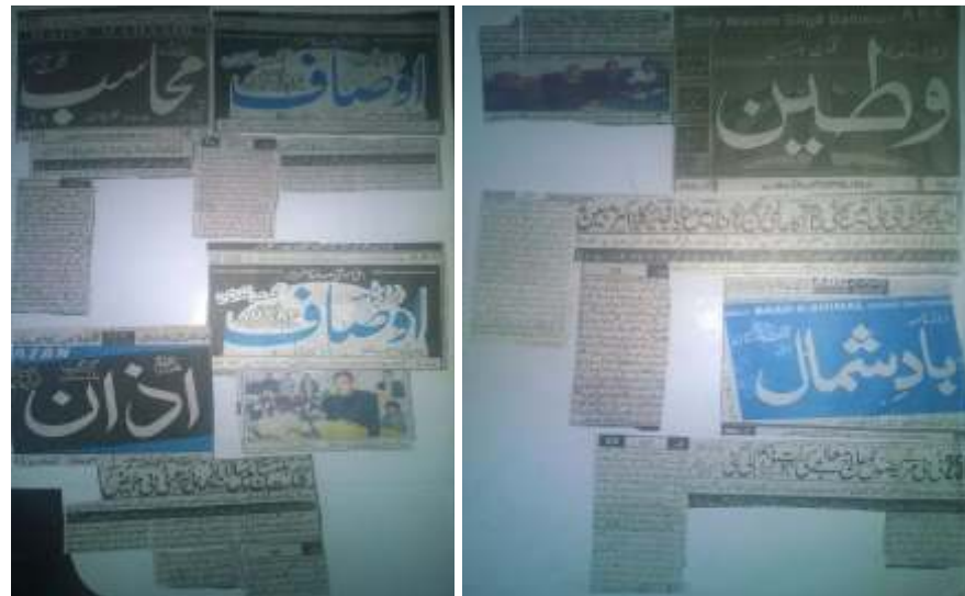
Statements in all the leading newspapers of GB on World TB Day

On the occasion of World TB Day, statements from Secretary Health, DG Health Gilgit and Baltistan and PTP Manager GB were published in all the leading newspapers of GB.