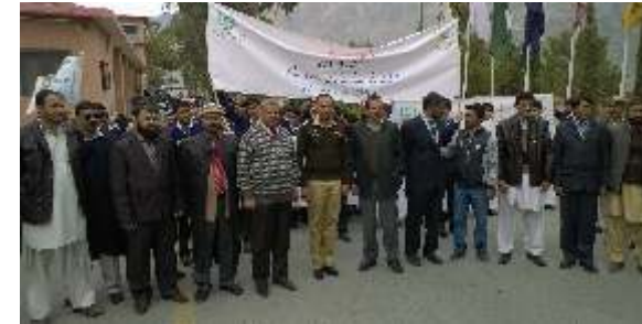
Awareness walk starting from Public School and College

An Awareness walk was held by the Public school and College administration Gilgit. Teachers and students of the Public school and college along with officials of the Provincial TB Control Program GB, community leaders and journalists from print and electronic media participated in the walk. The walk started from School and went through the main Gilgit Bazaar. Local Police also supported the walk. The walk was followed by the speech to the students by PTP manager and Principal of the school regarding TB Disease and World TB day.