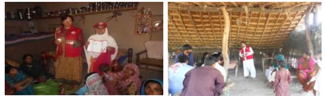
Seminar at Jamshoro on World TB Day 2014