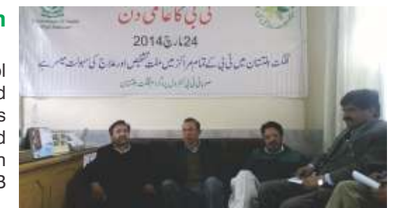
Press conference by DG Health along with PTP Manager