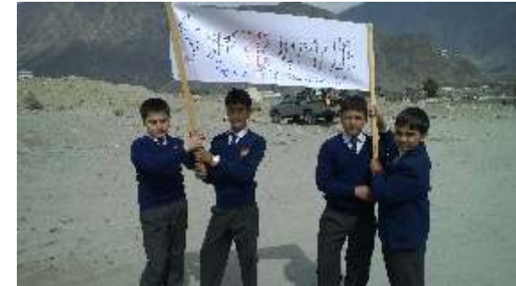
Students raising Banner "Stop TB in my Life"